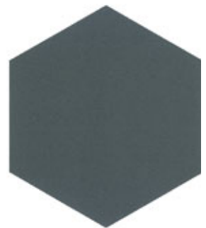
#109B Subdued Grey

Color chips are as close as possible to actual colors. Actual production line samples are recommended for final color approval.