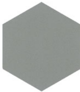
#109A Warm Grey