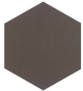
#104 Lava Bronze